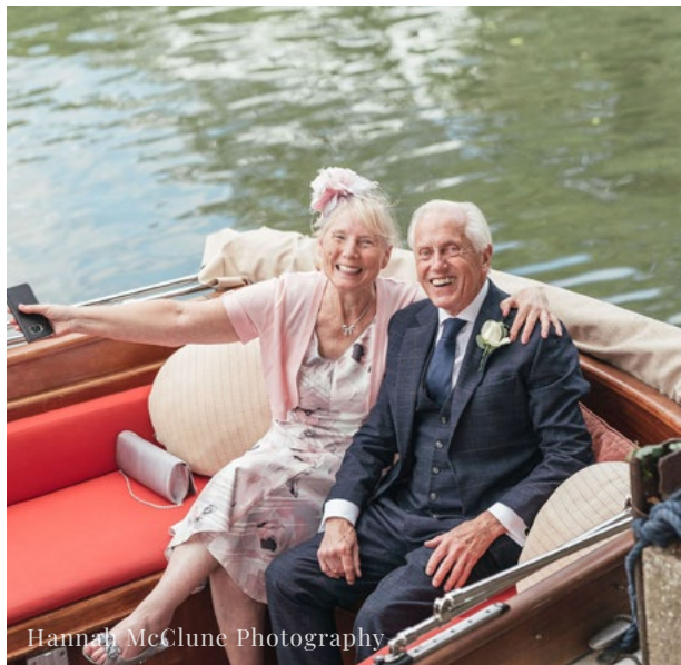
Hannah McClune Photography