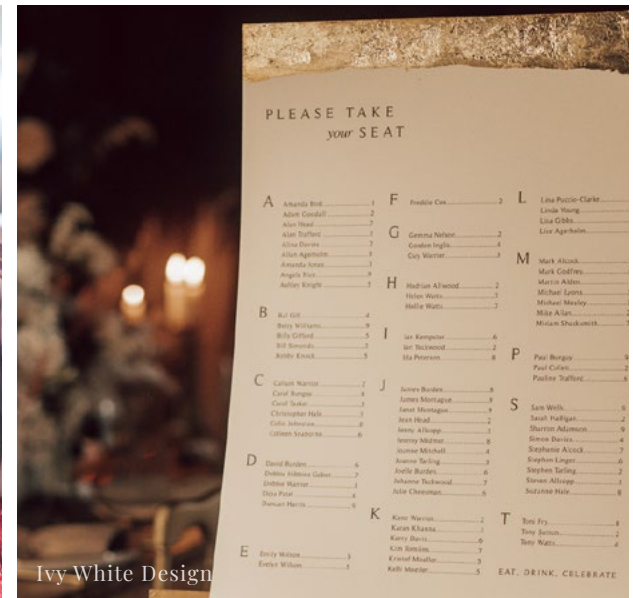
Ivy White Design